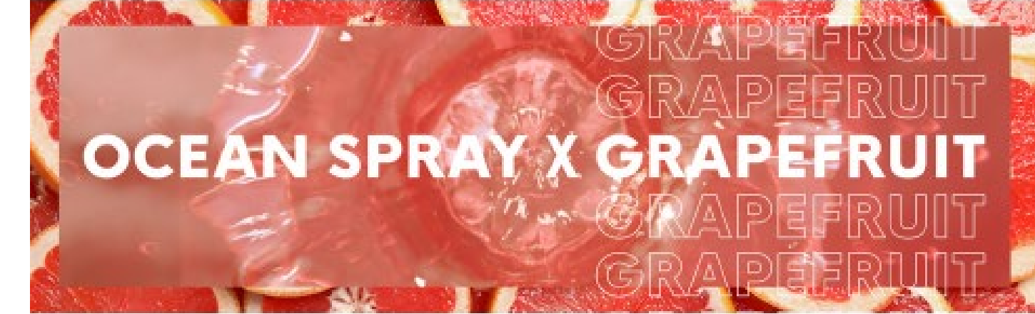
Ocean Spray Grapefruit Juice - Straight from the Grove

Let's examine the four essential parts of a product page, starting from top to bottom.