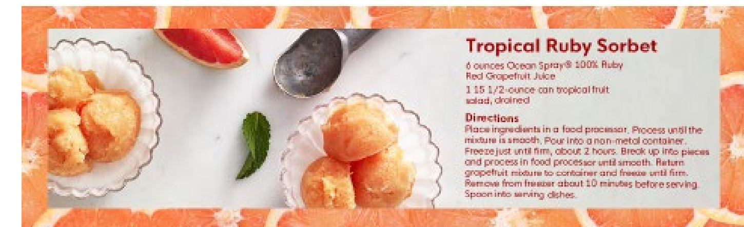
From Our Farms to Your Table

100 Calories Per Serving Each serving of Ruby Red grapefruit juice is only 100 calories and contains no high fructose corn syrup.